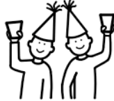
have a party